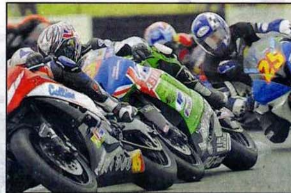
OVERCROWDED... 40 bikes fought for position at the first corner after the National 600 race had to be re-started at Donington Park.