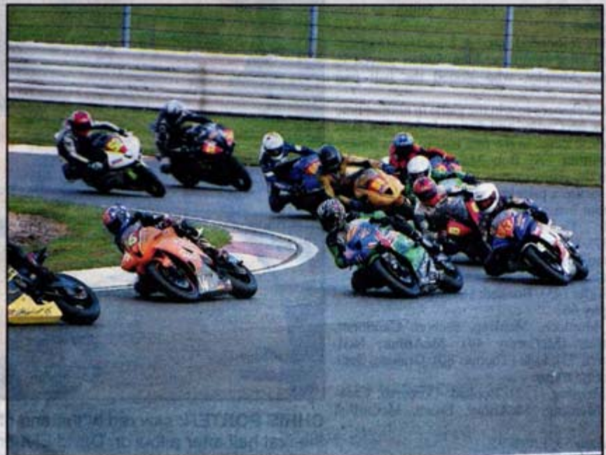
SETTING THE PACE: the 17-year-old speeds round this corner.